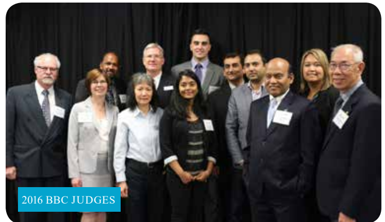
2016 BBC JUDGES