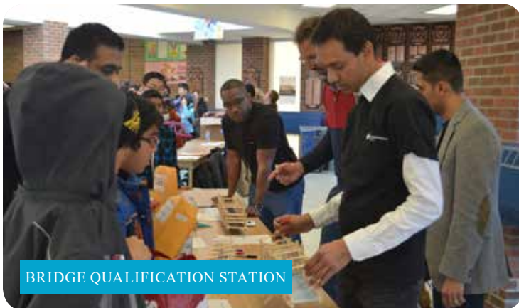
BRIDGE QUALIFICATION STATION

The Brampton Chapter would like to thank all of the volunteers, engineers, teachers, parents, friends and family who helped make this a very rewarding experience for our young minds in Brampton. We already have had inquiries about next year's Bridge Building Challenge. See you then!